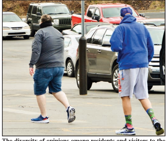
The diversity of opinions among residents and visitors to the area is always refreshing. Pictured here: people going about their business at Ingles in Hiawassee Sunday.

"I got the vaccine and I feel just fine. It hurt just like all the other needles, but it was over in a few seconds. It was no different than any other one I have gotten in my life – short and to the point. And if it helps,